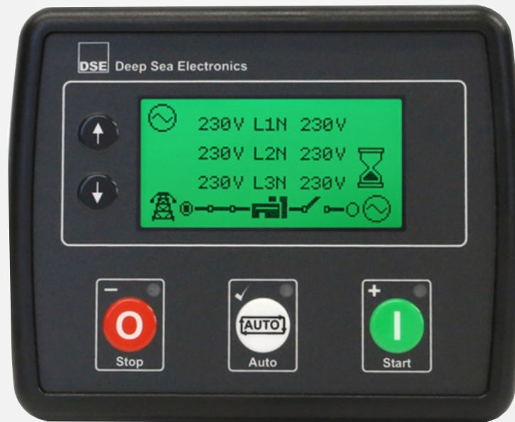
Controller: DSE4522 MK1